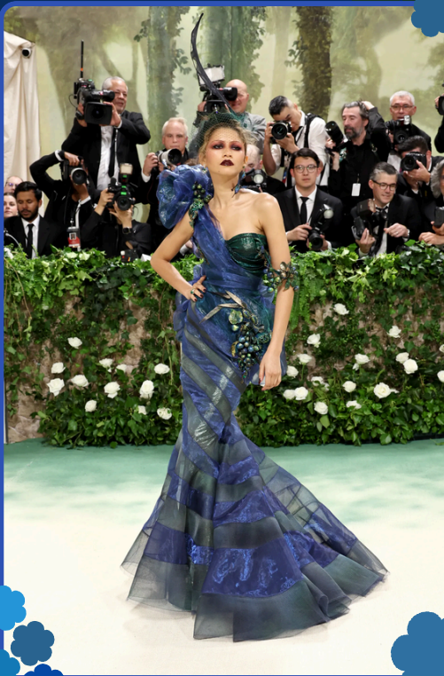
Zendaya in an inspired Maison Margiela

The annual met gala (formally announced as the “Costume Institute Benefit”, continuing in 2024 welcomed us with a theme: “The garden of time”. Strutting down the aisles, we were greeted with astounding sights, some of which were presented by stars such as Bad Bunny, Chris Hemsworth, Jennifer Lopez, and Zendaya!