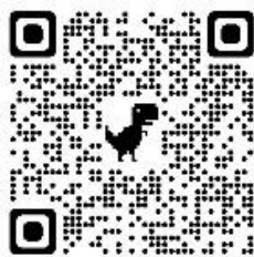
TPHS Careers Website